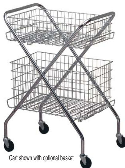
Cart shown with optional basket

272003 California Style Base Instrument Stand, 2 Pole Support