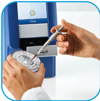
1 Insert sample.

Practices everywhere have discovered how the VetScan Chemistry Analyzer has improved practice efficiencies and saved them time and money. Simplicity, speed, through-put with results on-site, in minutes.