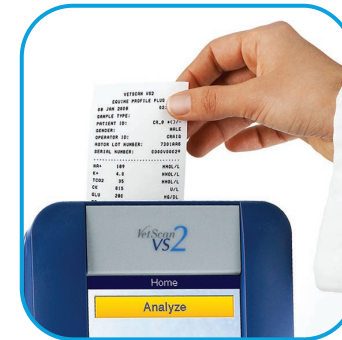
3 Read results.