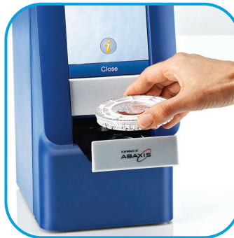
2 Insert rotor.